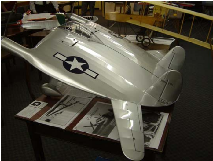
Southampton Model Aircraft Club's Concours d'Elegance night at the Atherley Bowling Club.