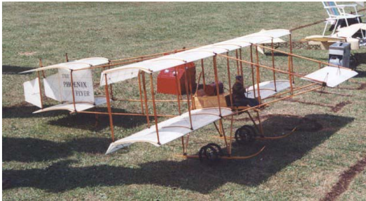
Boxkite with automaton pilot