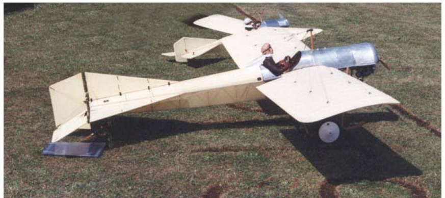
Two different scale Blackburn Monoplanes – note the pilots